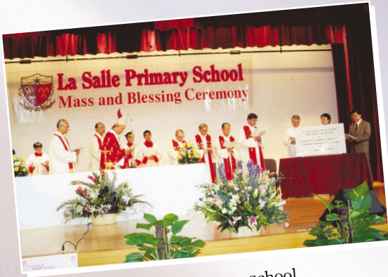
Blessing the new school 祝聖新校舍