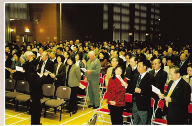
The Opening Ceremony concludes with the School Song.