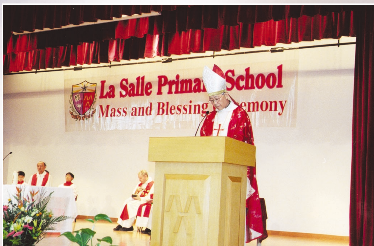
The Homily by the Bishop 主教講道

The mass ended with a blessing on the foundation stone. The blessing inspired that the whole school was under the guidance and care of our Heavenly Father. The ceremony was grand and solemn. We were most grateful to the Bishop and priests for sparing the morning to lead the mass.