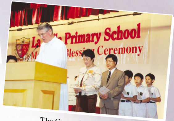
The General Intercessions 信友禱文