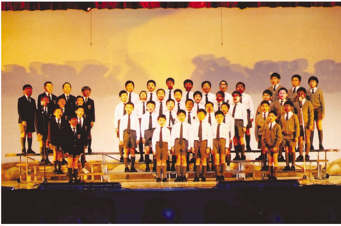
P.4-6 English Choral Speaking "The Three Little Pigs" 小四至小六英文集誦《三隻小豬》