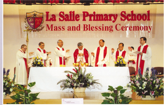
The Consecration of Bread and Wine 祝聖麵餅和葡萄酒