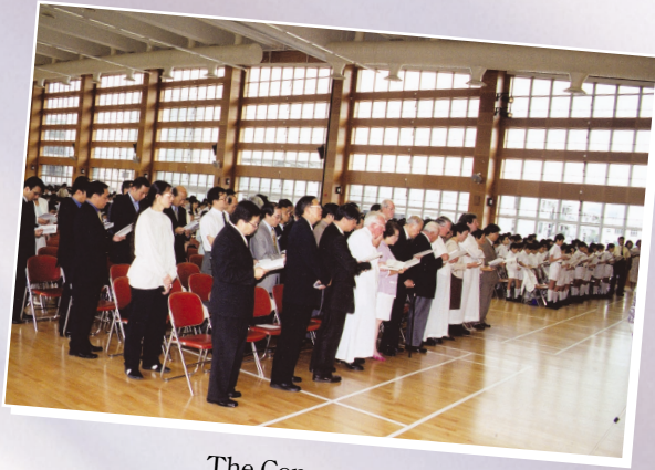
The Congregation 參與感恩祭的嘉賓及師生