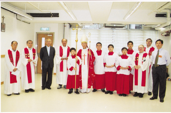
Group photo of the Procession 主教及主禮神父在感恩祭前拍照留念