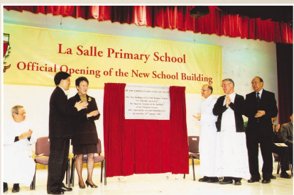
Superior General unveils the Plaque and declares the new school building officially open.