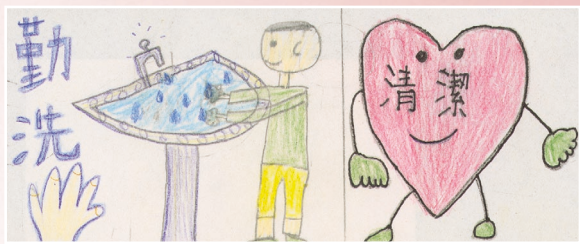
1D Hsu Kai Wei 許凱歲