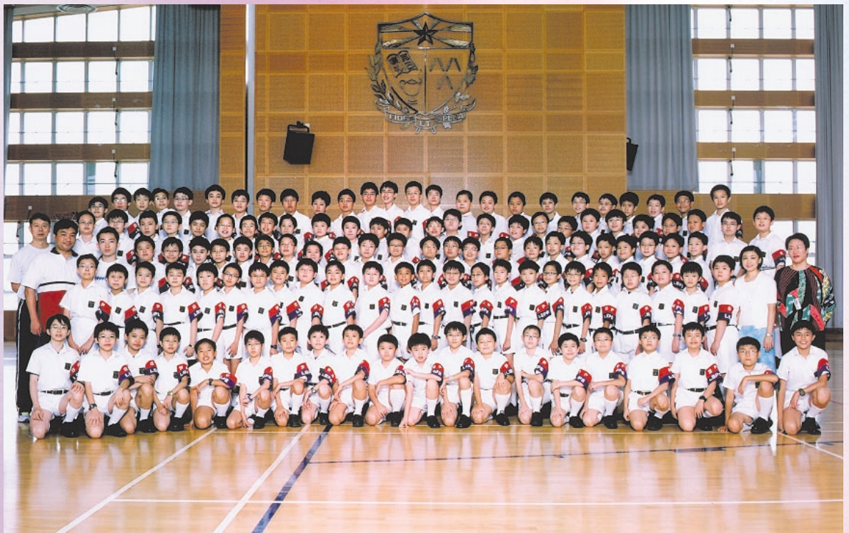
Group photo of School Prefects 風紀隊大合照