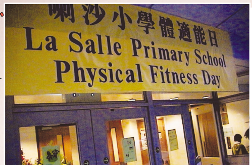
Physical Fitness Day — LSPSPTA assists the School to promote the importance of physical fitness. 「喇沙小學體適能日」— 家教會協助校方推廣體適能的重要性