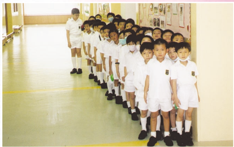
Prefect monitoring the discipline of Primary One boys 風紀維持一年級學生的秩序