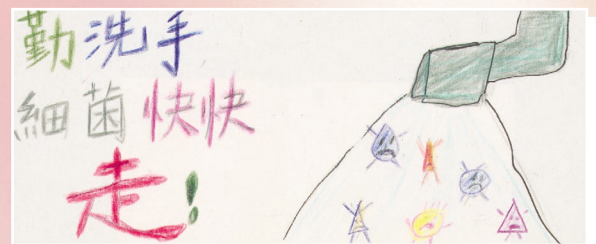
1C Ng Yu Long 伍于朗