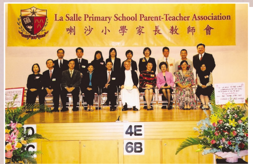
Members of the 2002-2003 Executive Committee of LSPSPTA 2002-2003 家長教師會委員合照