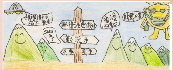
2F Wong Shui Cheung 王瑞璋