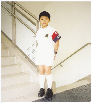
Prefect on duty 風紀於梯間當值