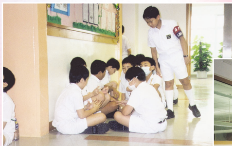
Prefect on duty during recess 風紀當值情況