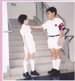
Prefect solving problems for others 風紀為同學解決困難