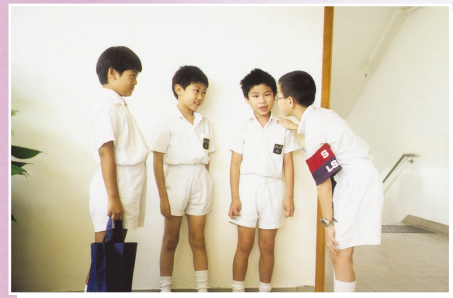
Prefect explaining the school rules to the junior boys 風紀向同學講解學校規則