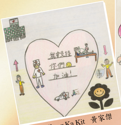
1D Wong Ka Kit 黃家傑