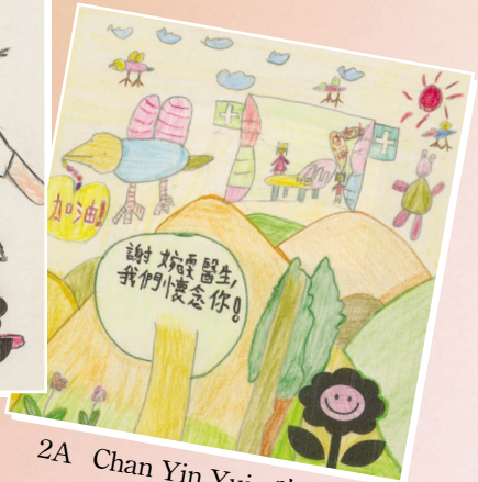
2A Chan Yin Yui 陳彥叡