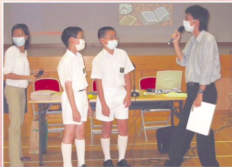
Talk on "Puberty" 「青春期」講座