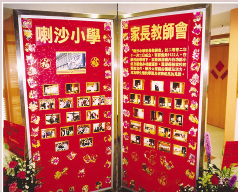
The PTA notice board — one of the communication channels between the School and parents 「家長教師會」展板 — 訊息溝通的另一道橋樑