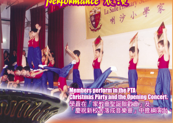
Members perform in the PTA Christmas Party and the Opening Concert. 學員在「家教會聖誕聯歡會」及「慶祝新校舍落成音樂會」中擔綱演出。