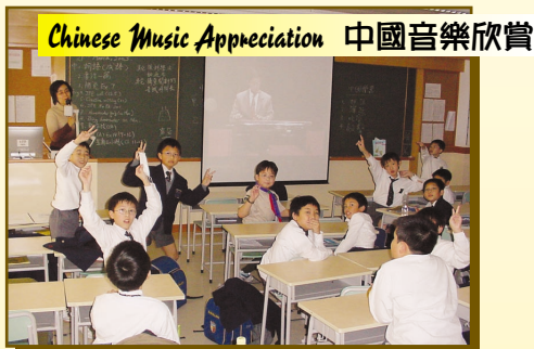
Chinese Music Appreciation 中國音樂欣賞

The pupils are watching a VCD programme about Chinese lute. They are excited! 正在播映中國古琴演奏 VCD，學生十分興奮！