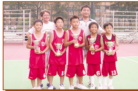
We are the Champion, 1st Runner-up & 2nd Runner-up of Shooting Competition, 2002-2003 2002-2003年度學生街頭三人賽，【三分投射賽】，分別獲得冠、亞、季軍