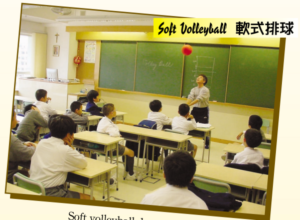
Soft Volleyball 軟式排球