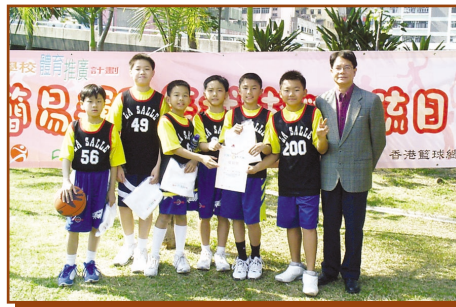
The 'Group Champion' 簡易籃球比賽，獲得【組】冠軍