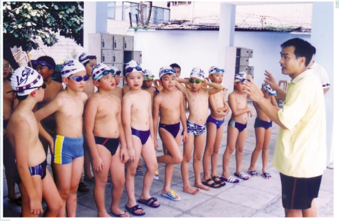
Learning Putonghua and swimming in one go - coaching in Putonghua. 教練以普通話教授，在習泳之餘又可以學習普通話，真好！