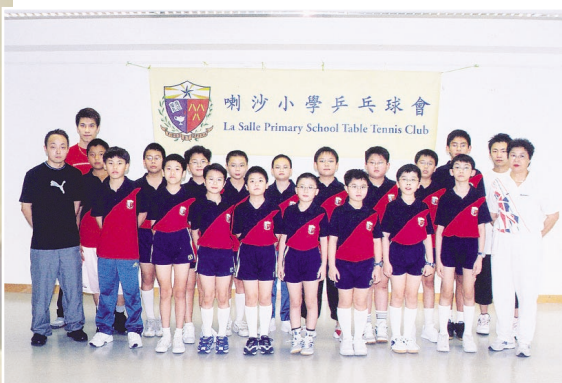
P5-P6 members with their coaches 五至六年級訓練班同學及教練合照