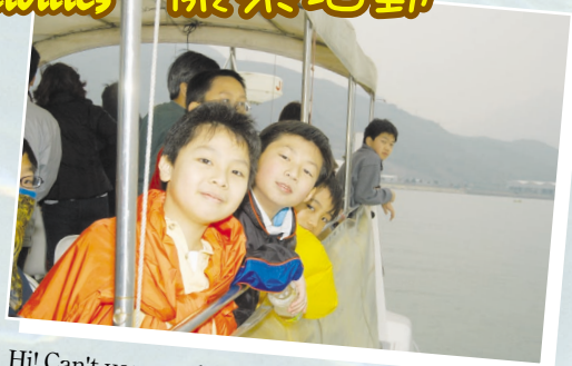
Hi! Can't you see the Chinese White Dolphins? No? Doesn't matter. Take a deep breath. Feel the fresh air. What's more? The scenery is just splendid. 喂！你看見中華白海豚沒有？看不到？不要緊，呼吸一口新鮮空氣也好，欣賞四周的風景也不錯。