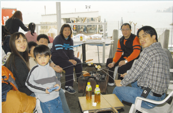
BBQ food... Yummy! 雞翼，我最喜歡吃！