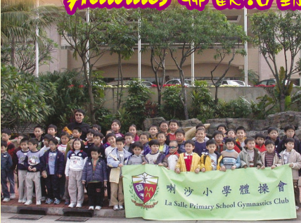
The Club organised a variety of gatherings and functions, including a day tour to the New Territories, and a barbecue party. Members also participated in the All Sports Clubs' Gratitude Dinner and Sports Training in China. 體操會於去年為學員籌辦了多項活動，包括聚餐、旅行及參與體育會聯辦之「東莞集訓」及「答謝晚會」等，得到會員熱烈的支持。