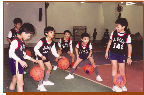
The pupils are very serious! 各球員聚精會神地練習