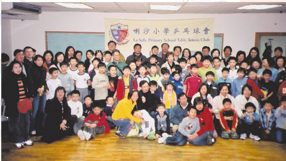
Parent-child table tennis training in Shenzhen, China 「親子深圳乒乓球集訓一日遊」

展望將來，球會在各方支持下，表現將百尺竿頭，更進一步。透過乒乓球這項運動，讓喇沙小學的團隊精神，延續下去。