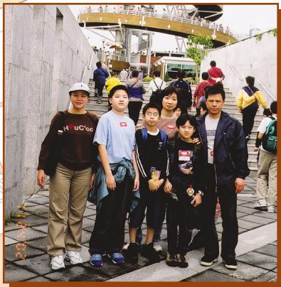
Autumn Outing 球會秋季大旅行