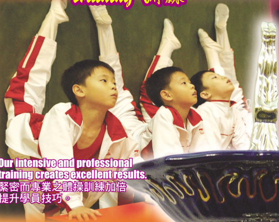
Our intensive and professional training creates excellent results. 緊密而專業之體操訓練加倍提升學員技巧。