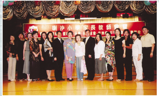
Teachers-in-charge & the committee members of 2002-2003 2002-2003 年度負責老師及委員

泳會活動不只限於游泳，還注重會員間的聯絡和溝通，令大家相處融洽，互相照顧，不分彼此。我們的日常活動多采多姿，並讓不同程度的學員都有機會參與比賽，藉此增強他們的信心和積累出賽的經驗。