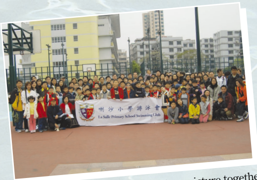
Club activity — picnic. Let's take a picture together before setting off. 泳會活動——郊外旅遊；出發前先來一張大合照。