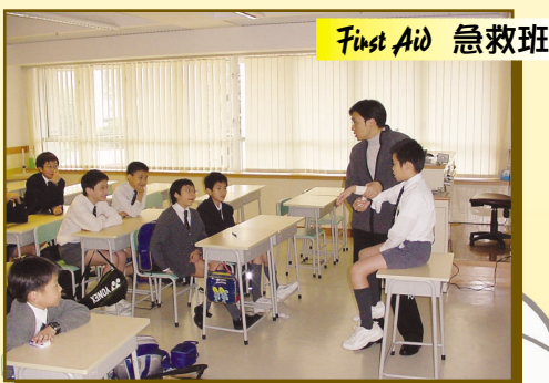
First Aid 急救班

The teacher is demonstrating how to use bandages to bind the wound. 老師正在示範利用繃帶包紮傷口