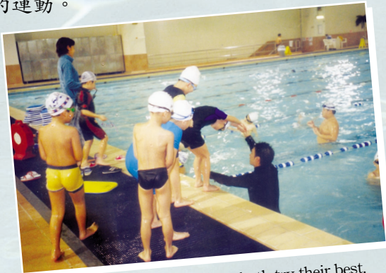
The coach and the coached - both try their best. 教練認真指導；學生專心學習

Besides swimming, our Swimming Club also emphasizes the relationship and communication among members - all members have close and harmonious relationship and they always care for one another. Our activities are varied and interesting. Members of each swimming level have chances to take part in different swimming competitions, so as to enhance their confidence and enrich their experience to compete.