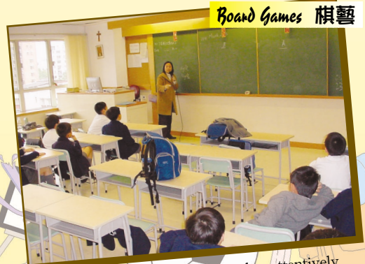
Board Games 棋藝

The teacher is demonstrating how to use bandages to bind the wound. 老師正在示範利用繃帶包紮傷口