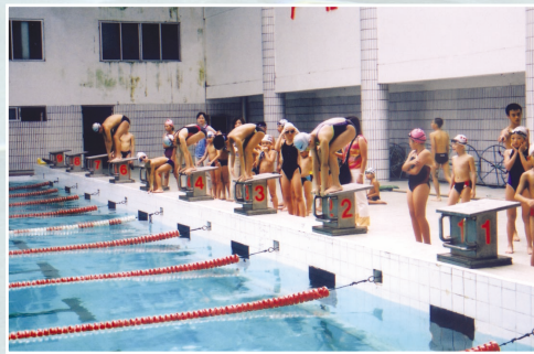
Friendly match — Hurray! The swimmers are really great! Let's do our best! 友誼比賽——加油！努力！他們的泳術真棒，我們真的要加把勁，好好向他們學習了。