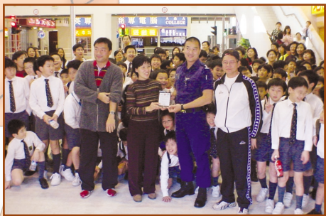
Our teachers, parents and pupils visit Police Tactical School 籃球學員與家長及老師參觀【警察訓練學校戰術大樓】