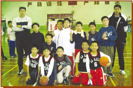
P.6 pupils participating in the Training Camp held at Guangzhou, China 六年級學員參加廣州集訓