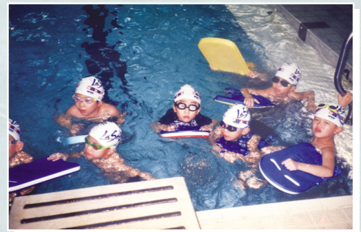
Look! Here come our future swimming stars! 看！我們未來的小飛魚！