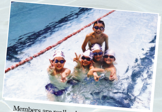
Members are really close and harmonious. 會員相處得多融洽